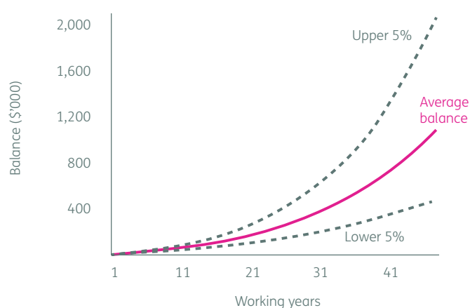
Variations in retirement balances at retirement